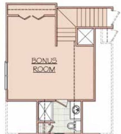
OPTION 'C' BONUS w/ BATH 370 SQ. FT. BONUS ROOM